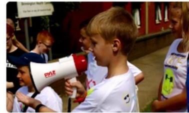
MEDIA AND MPS