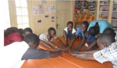
SAYING THANK YOU