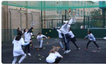
PROMOTING YOUR EVENTS