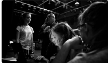
USING SOCIAL MEDIA