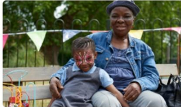
STYLING YOUR EVENTS